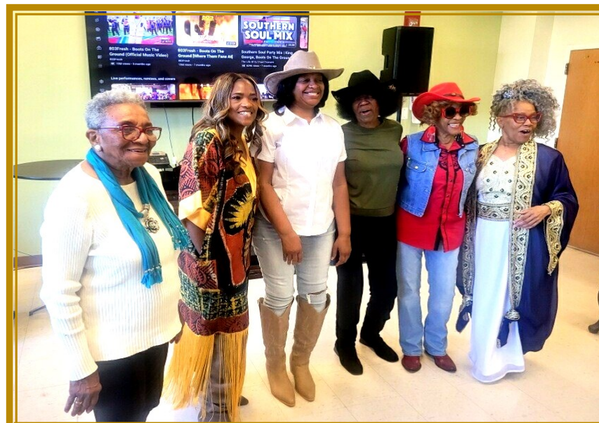
Members of the group " Boots on the Ground " gave a wonderful performance of poetry, dance and songs for the residents.