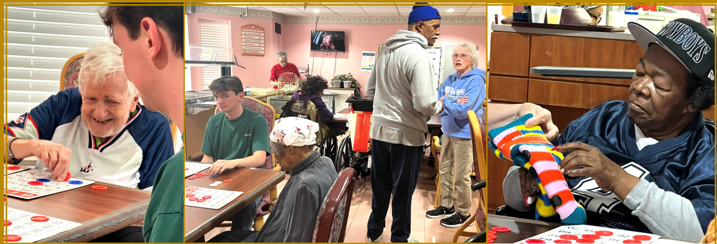
Residents enjoy Bingo with volunteers who are members of Mount Pleasant Village .