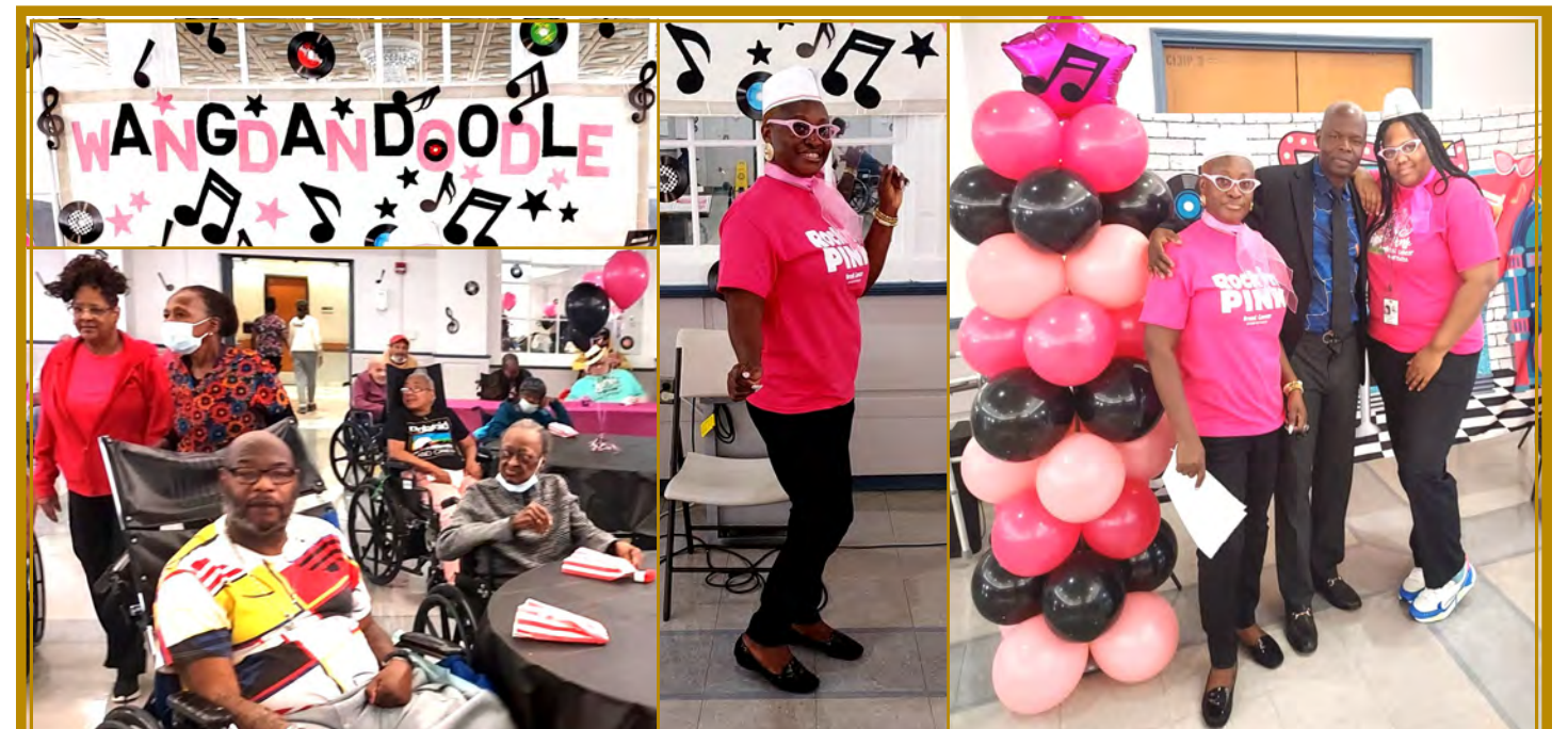
Staff and residents enjoy fun and fellowship during October Wangdangdoodle Activity .