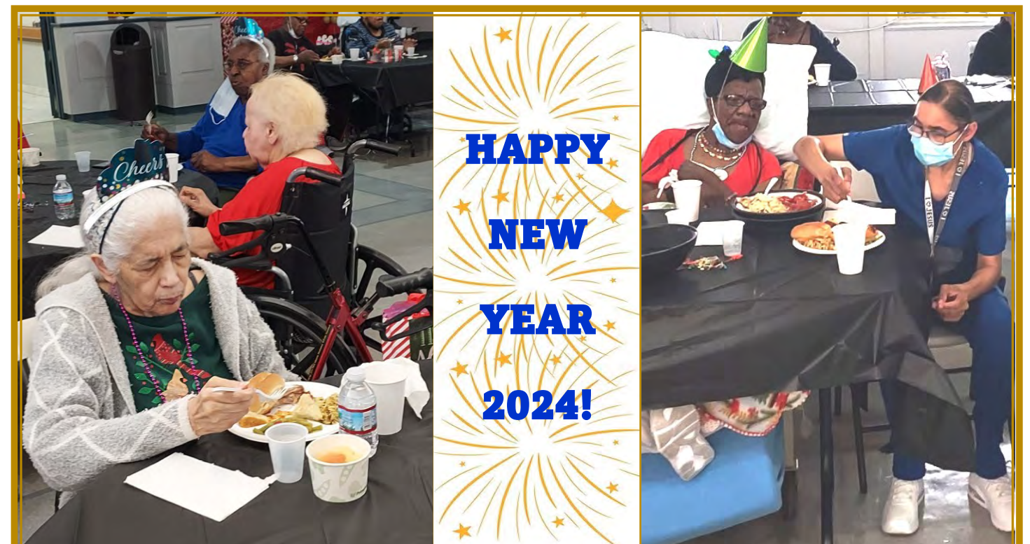
Residents enjoy a New Year's Eve Party to celebrate 2024!