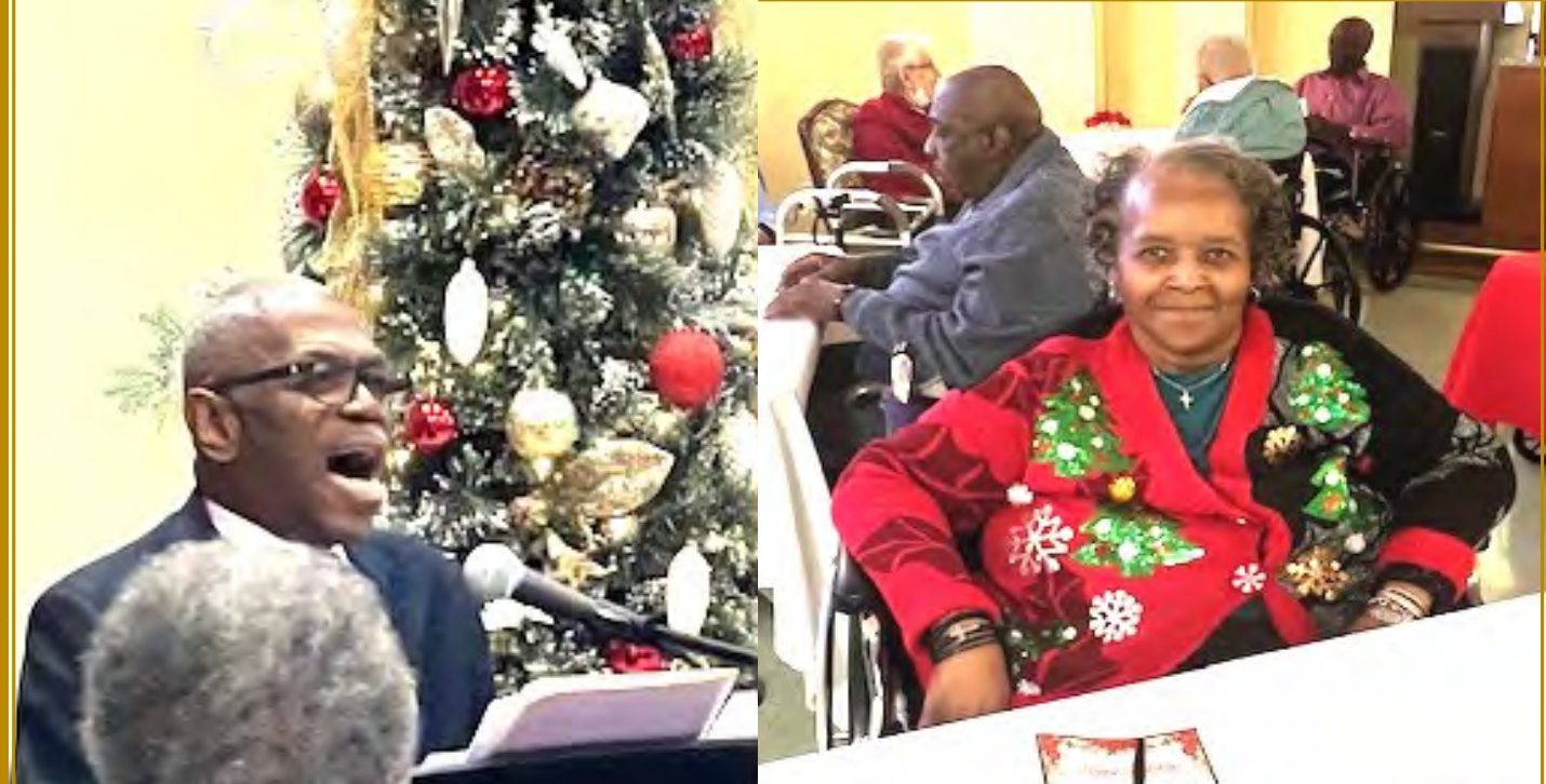
The Annual Holiday Open House and Program is a joyous occasion of fellowship and fine dining.