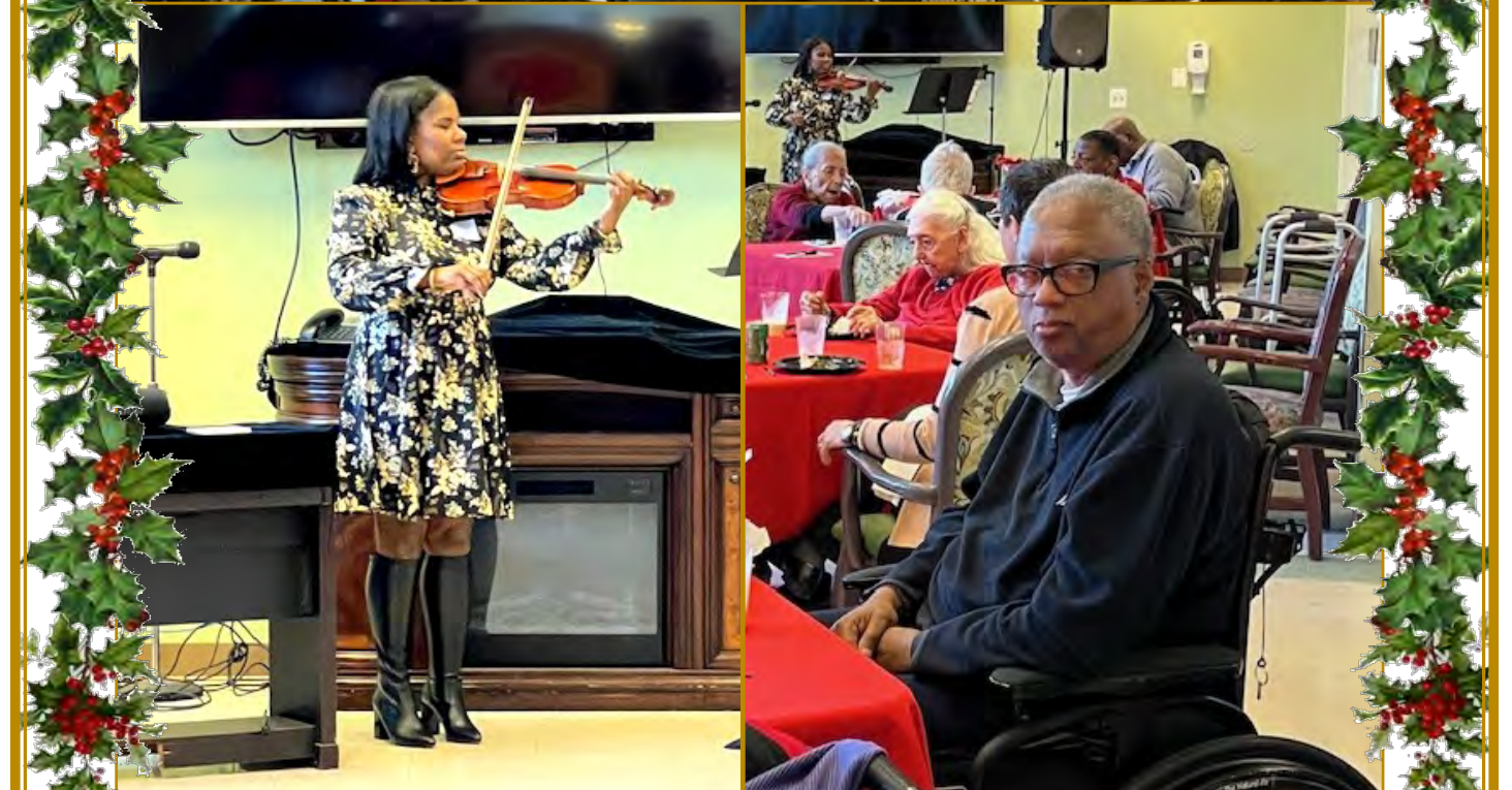
Residents celebrated the Spirit of Joy with a wonderful Christmas Celebration.