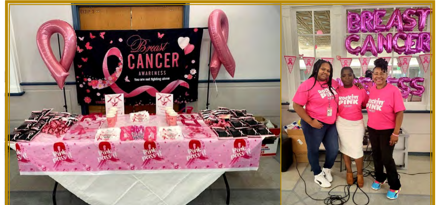
In October, staff members promote initiatives for Breast Cancer Awareness Month .