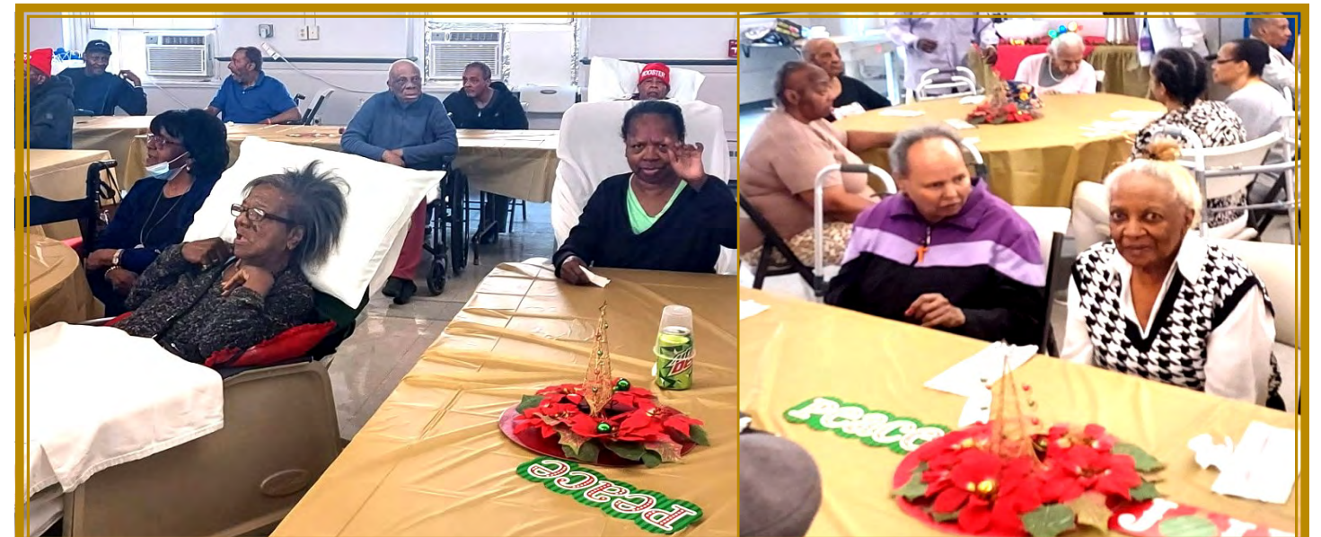
Residents enjoy fun and fellowship at Christmas Party .