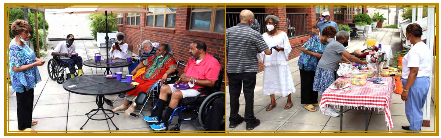
Residents attend and participate in the First Baptist Deacon Association's Program and Social Event.