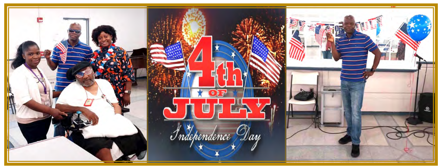
Staff and residents celebrate Independence Day.