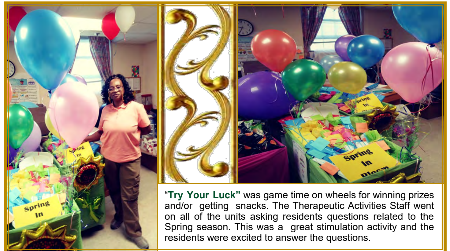
“Try Your Luck” was game time on wheels for winning prizes and/or getting snacks. The Therapeutic Activities Staff went on all of the units asking residents questions related to the Spring season. This was a great stimulation activity and the residents were excited to answer the questions.