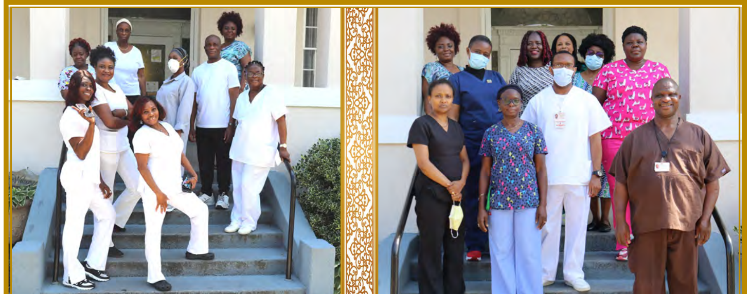
Certified Nursing Assistants were celebrated during National Nursing Assistants Week (June 17-24).