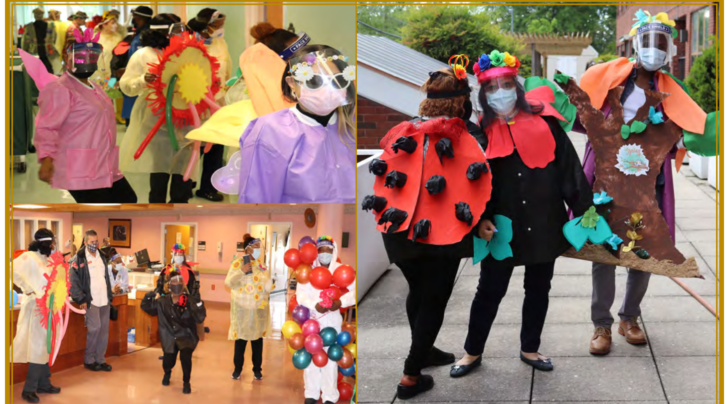
PPE Fashion Show during National Skilled Nursing Care Week.