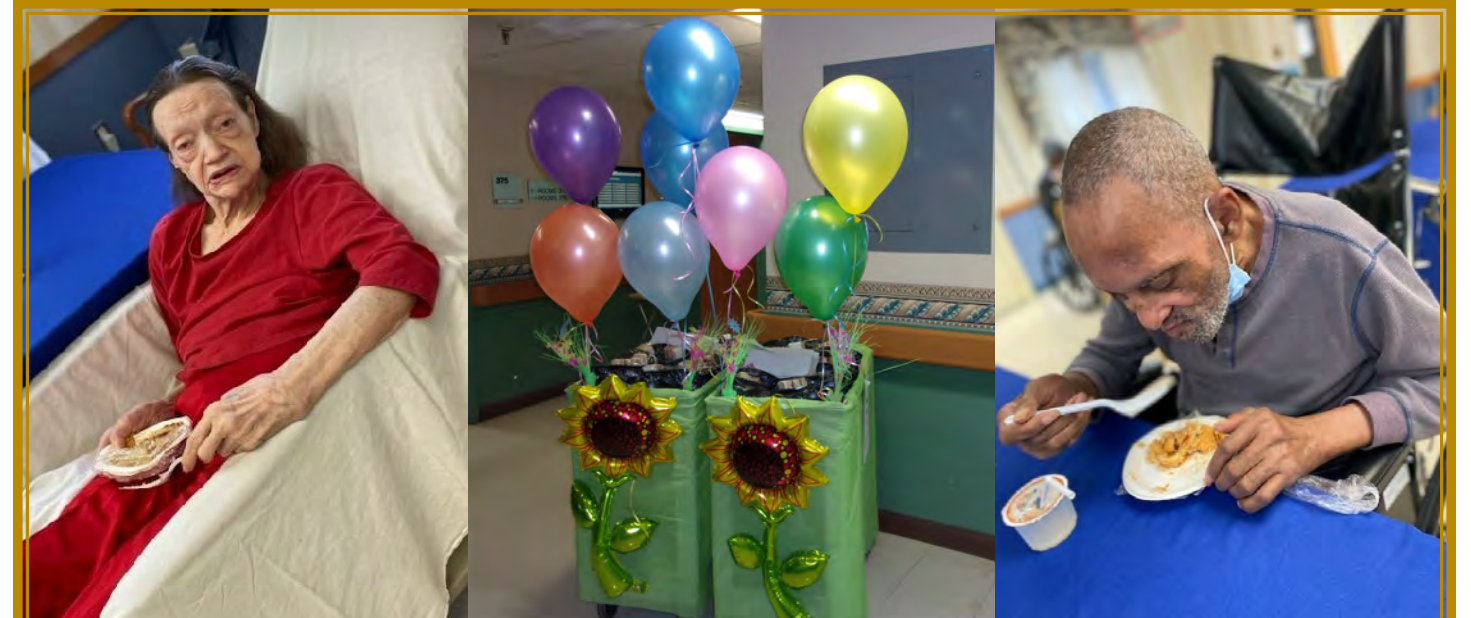
Residents enjoyed homemade pies, which were distributed on all of the units.