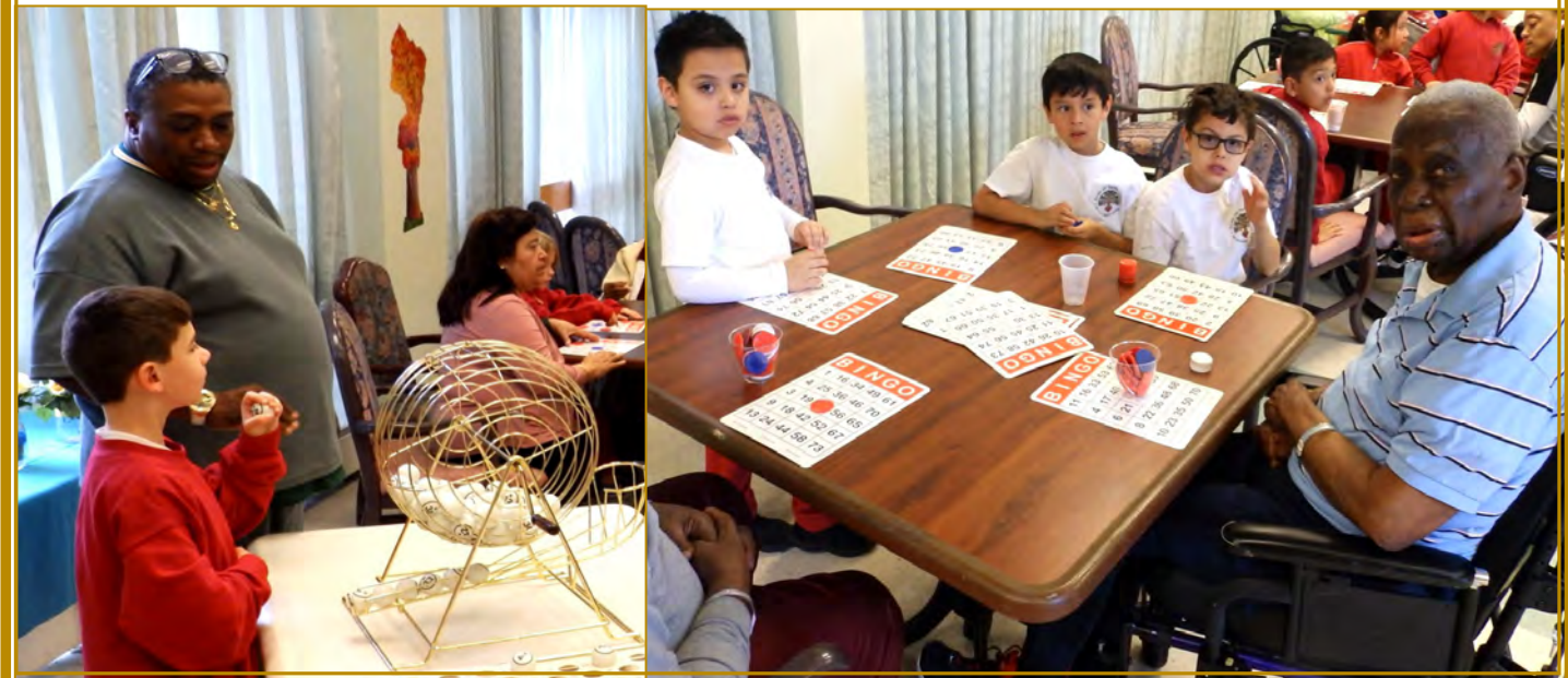
Bingo with Students from Sacred Heart School