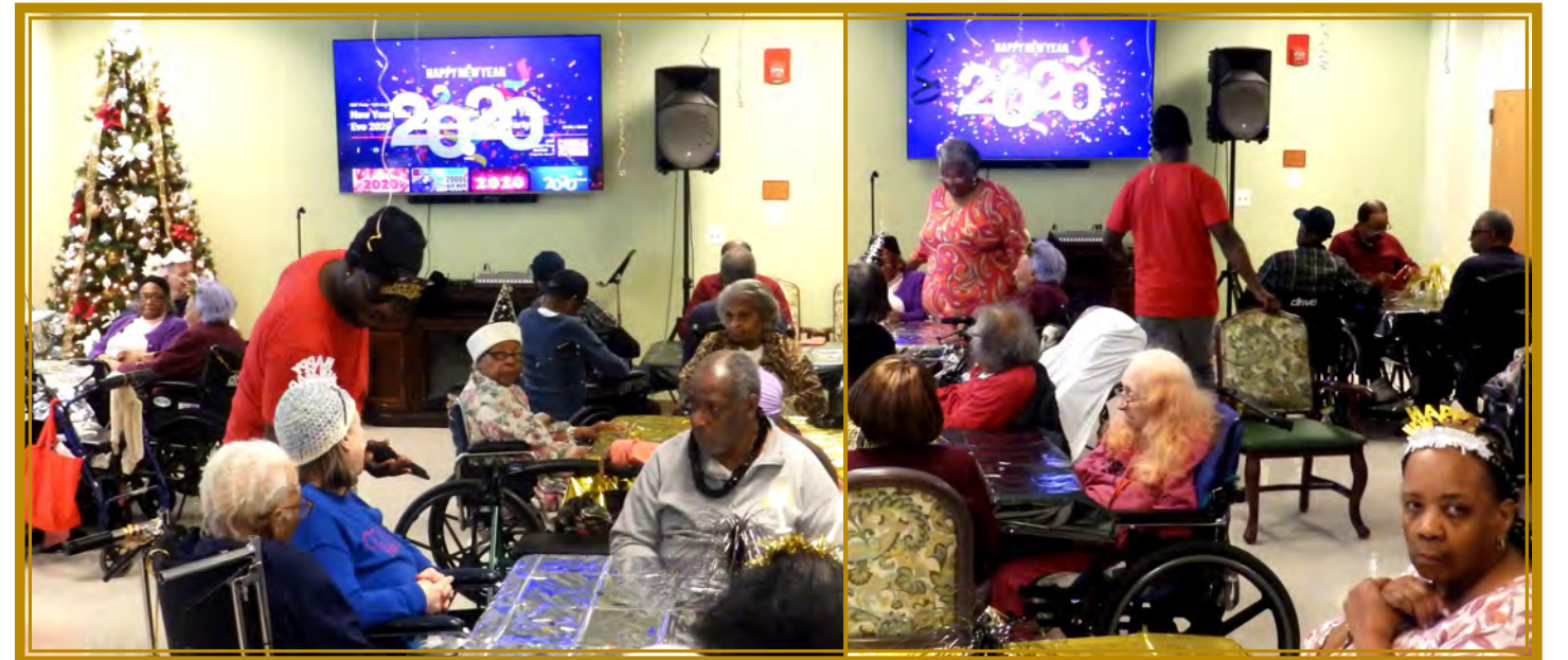
New Year's Eve Party