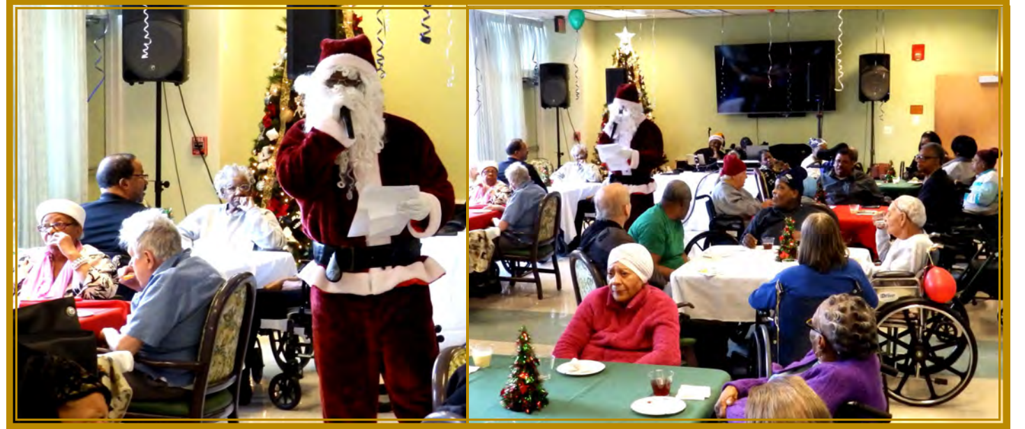
Resident Christmas Party