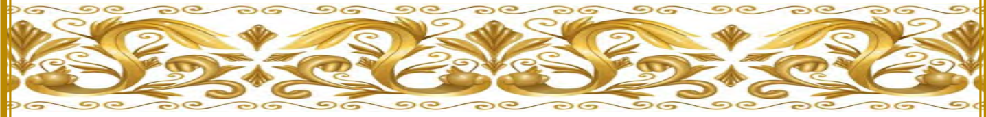
Monthly/December Birthday Party