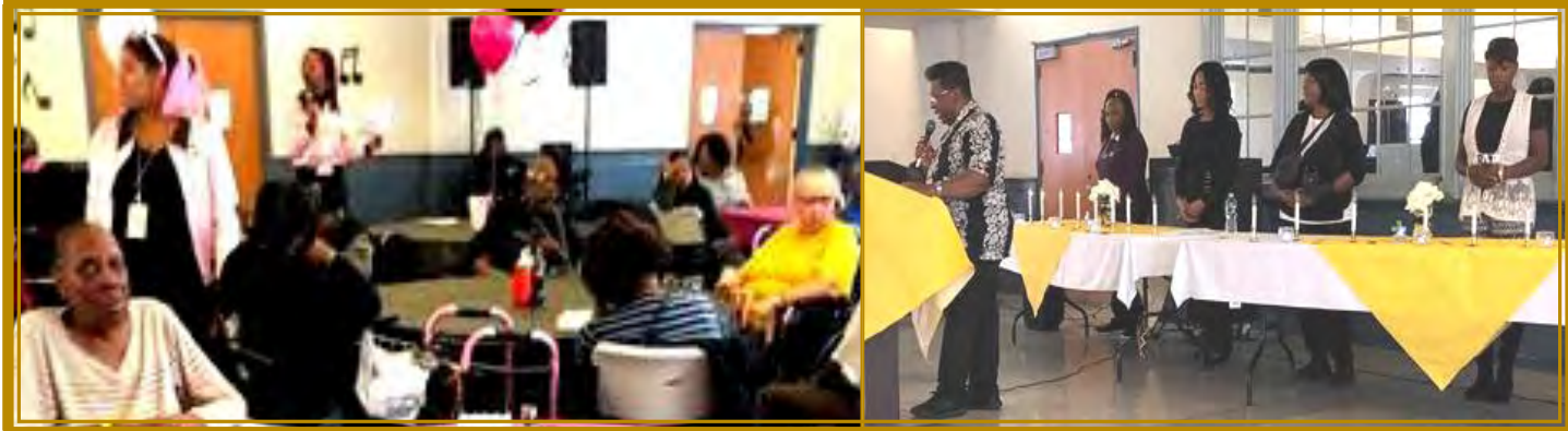
October 23 rd - Residents celebrated “Wangdangdoodle” with good food, great music, prizes and lots of fun.