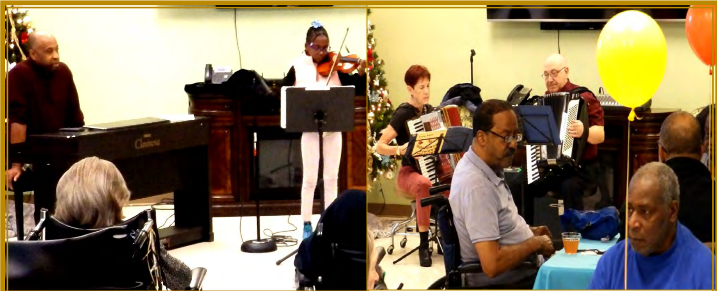
Black Student Fund Talent Show