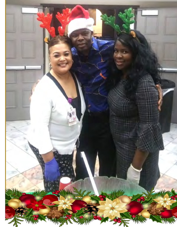
Staff Holiday Greeting