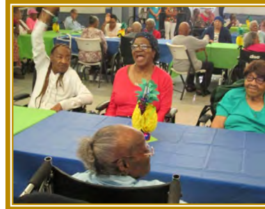
The “Ladies Club Chill Out” was held on Thursday, September 13 th . The ladies (as well as some men invited) enjoyed a good time of fun, food, fellowship and music.